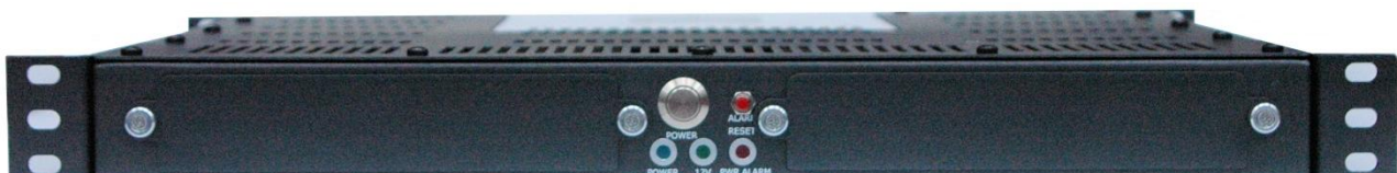
SB1201E Front panel (blanking plates shown)